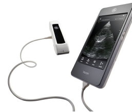
Vscan Extend with Tricefy Inside