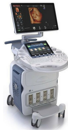
Voluson using external Tricefy Uplink