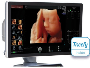
Voluson with Tricefy Inside