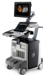
LOGIQ E with Tricefy Inside