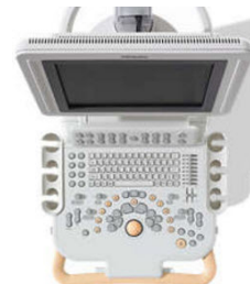
HD11 & HD15