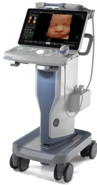
Voluson Swift with Tricefy inside